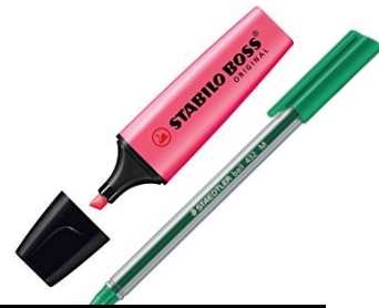
PENS AND HIGHLIGHTERS